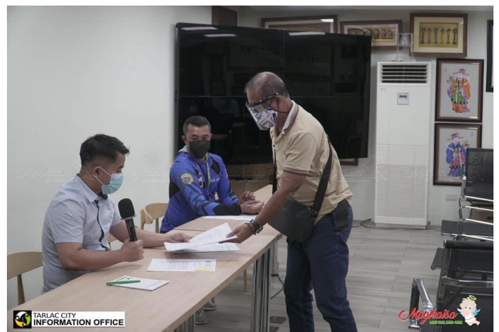
Meeting with the TAMOGEPA and PGT Transport Service Cooperatives