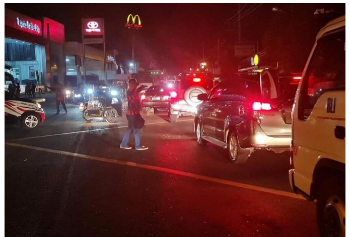
San Miguel Traffic Operations