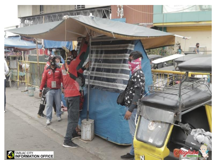
Traffic operations on the rehabilitation of the drainage along Mc Arthur Highway in front of SM Tarlac