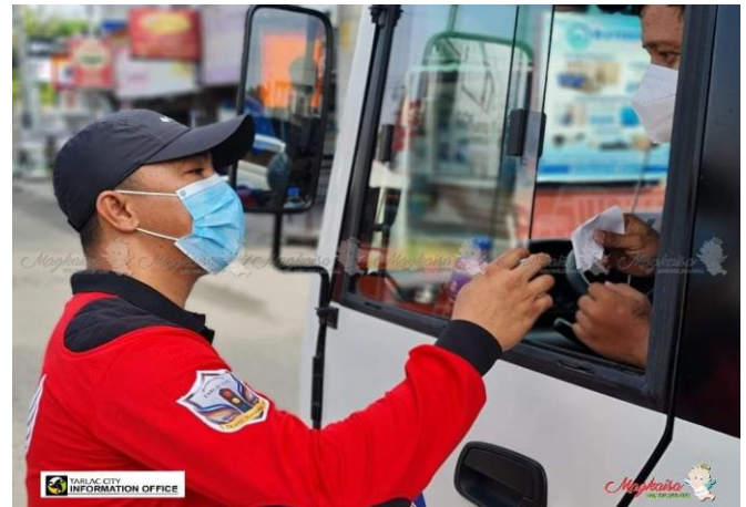
Regular operations at Mc Arthur Highway